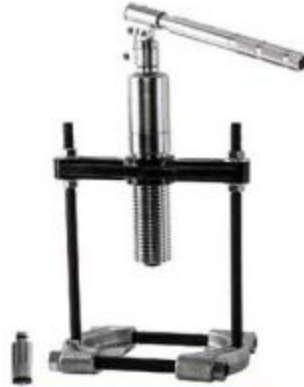
SPM-__10系列 SPM-__10 TYP.