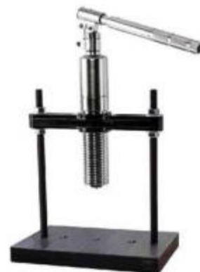
SPM-__30 系列 SPM-__30 Series