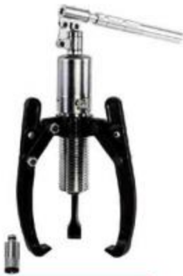
SPM-__00系列 SPM-__00 TYP.