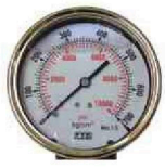
CBM 埋入無緣 Center back mount