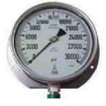
LMBF 直立背緣 frange back with mount Lower