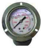
CBMFF 埋入前緣中(邊)孔 Center back mount with front fringe