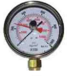
-M 遺留式 Max. Indicator Pointer